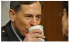
Petraeus' Collapse: A Grim Metaphor for the Prospects of the Kandahar Offensive