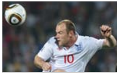
Why Isn't There a Soccer Team for the Whole United Kingdom?