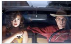
The Uncanny Realism of Michael Winterbottom's Films