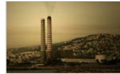
Skeptics Say the New Climate Bill Will Make America Less Secure. They're Wrong.