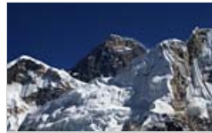
What Happens When You Make a Terrible Mistake While Climbing Everest?