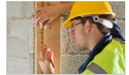
Bogus Trend Watch: Are College Graduates Really Doing More Manual Labor?

site map | build your own Slate | the fray | about us | contact us | Slate on Facebook | search feedback | help | advertise | newsletters | mobile | make Slate your homepage